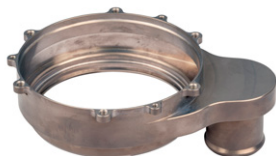
_____ RFC-89 TN-COL