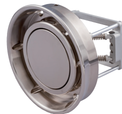
_____ RFC-88 N