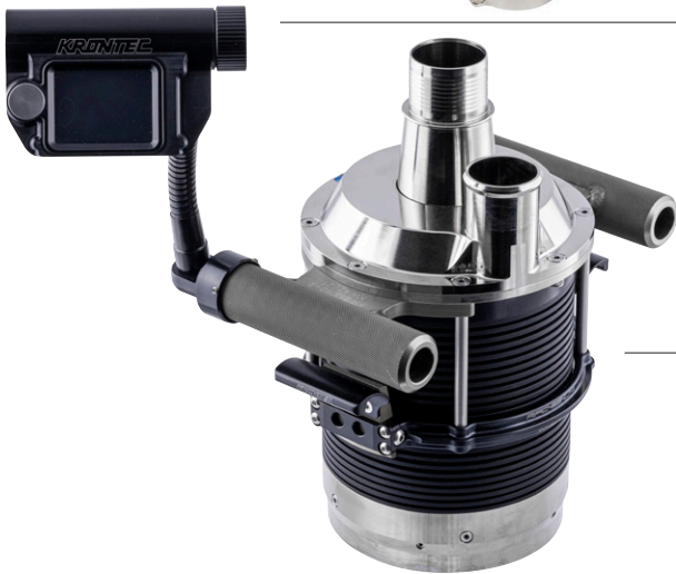
_____ RFC-89 K-(LM)