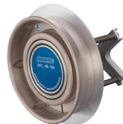
_____ RFC-88 DN