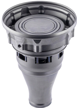
_____ RFC-89 TM-LM